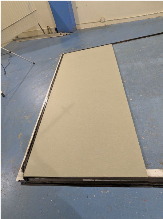
Figure 2 – Specimen partially installed