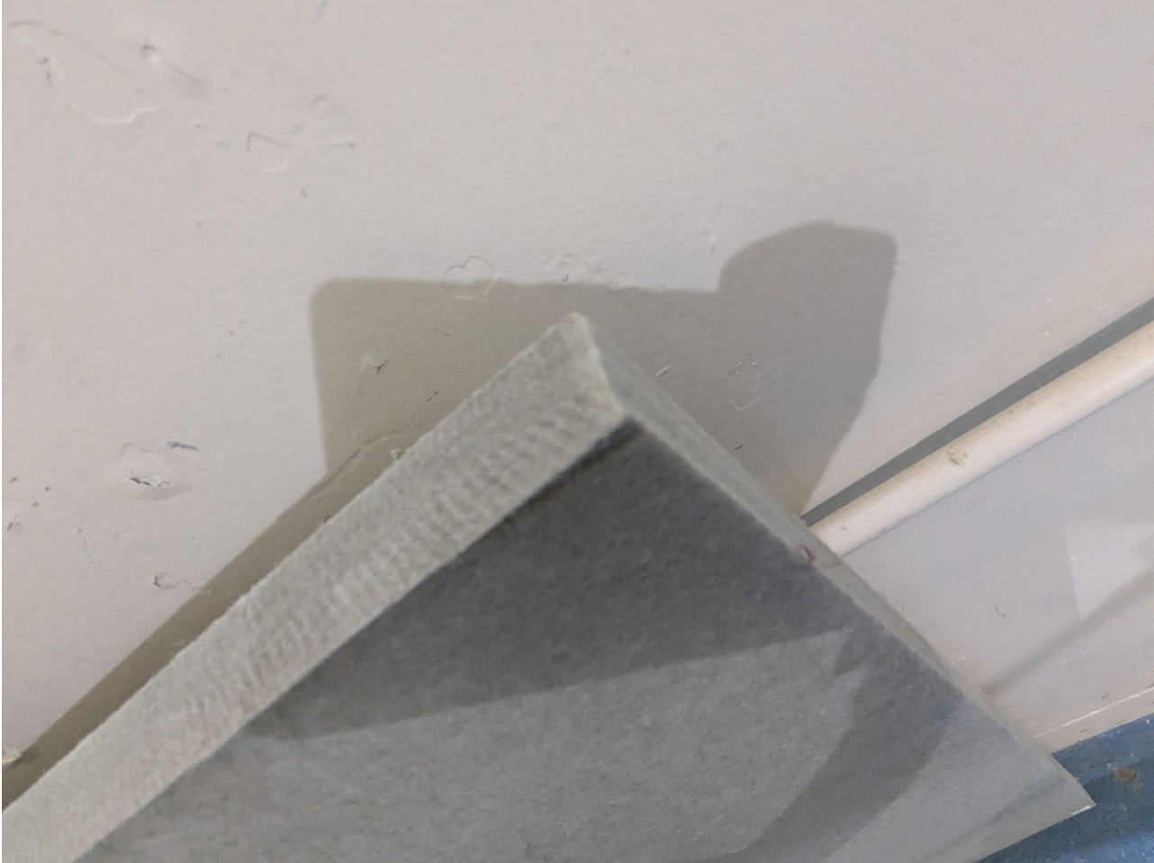
Figure 3 – Detail of specimen material